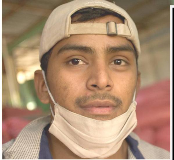
Coffee processor in Nicaragua.

"God intended the earth and everything in it for the use of all human beings and peoples. Thus, under the leadership of justice and in the company of charity, created goods should flow fairly to all.