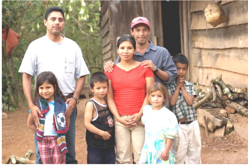
CRS staff and partners in Nicaragua

"The economy should work for people, and not the other way around." - Economic Justice for All