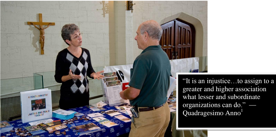
Parishioners in the Archdiocese of Los Angeles.