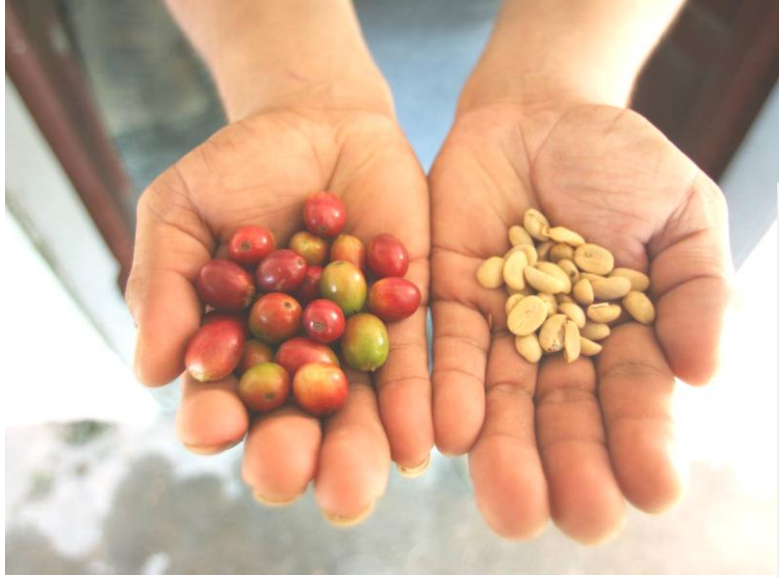
Mexican coffee cherries and beans.

"The remuneration of work is not something that can be left to the laws of the marketplace; nor should it be a decision left to the will of the more powerful. It must be determined in accordance with justice and equity; which means that workers must be paid a wage which allows them to live a truly human life and to fulfill their family obligations in a worthy manner." —Mater et Magistra<sup>1</sup>