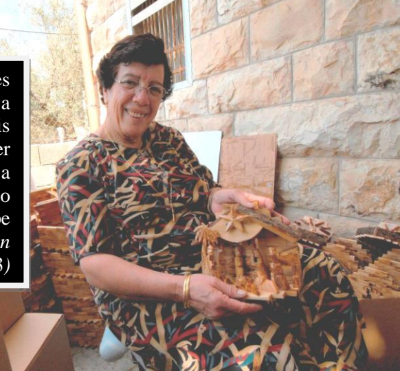
An artisan from Shepherd's Field in the Holy Land