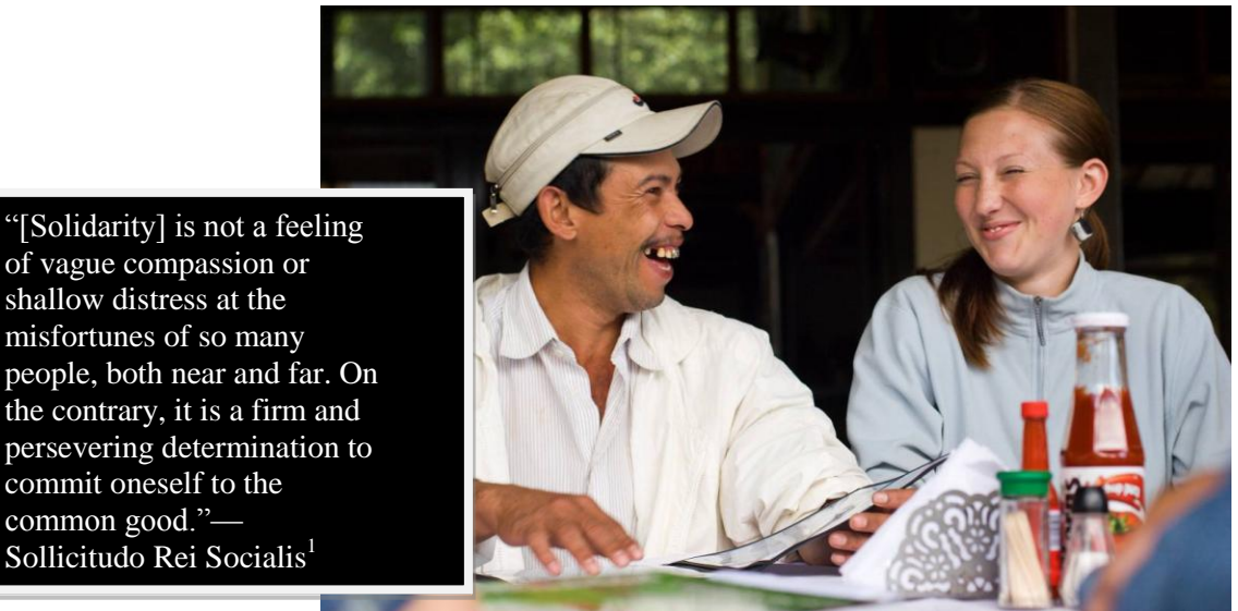
Producer and consumer enjoy time together in Nicaragua.