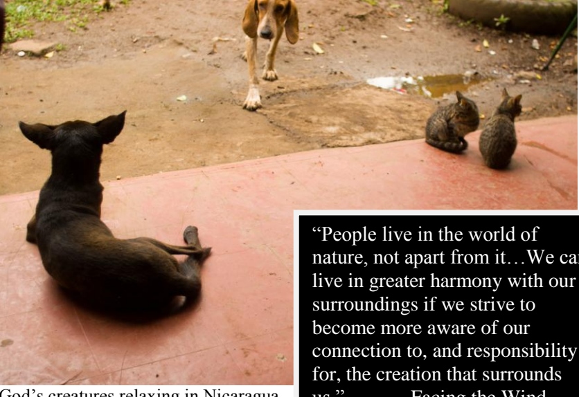
God's creatures relaxing in Nicaragua

nature, not apart from it...We can live in greater harmony with our connection to, and responsibility us." ---- Facing the Wind, What Are the Signs?<sup>1</sup>