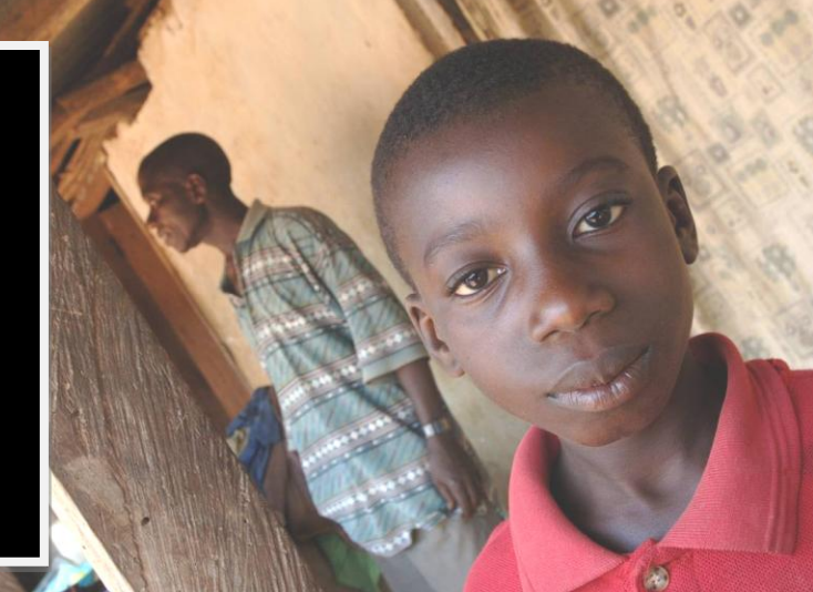
Father and son in Ghana.

"As followers of Christ, we are challenged to make a fundamental 'option for the poor'—to speak for the voiceless, to defend the defenseless, to assess life styles, policies, and social institutions in terms of their impact on the poor...those with the greatest needs require the greatest response."—Economic Justice for All