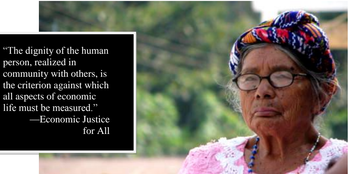
A member of the Santa Anita, Guatemala community