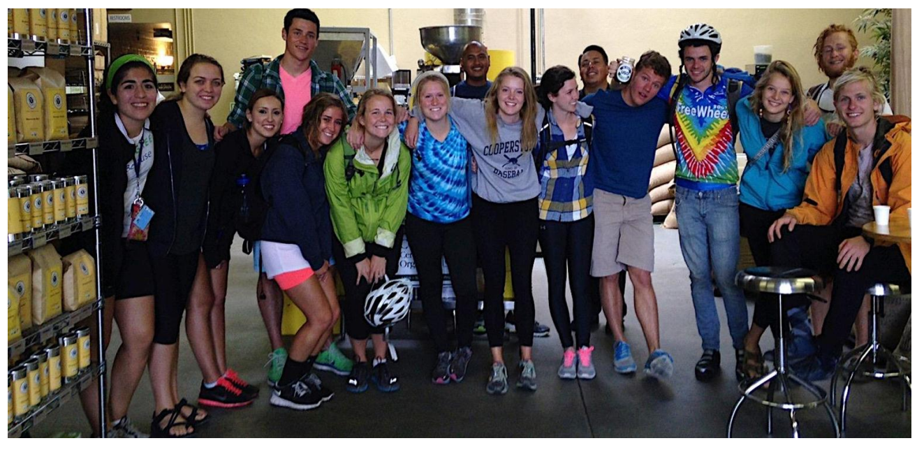
University of San Diego students and San Diego Fair Trade advocates at Café Virtuoso in Barrio Logan, San Diego on USD Students for Fair Trade's 1st Semi-Annual Roast N Roll in April 2014.